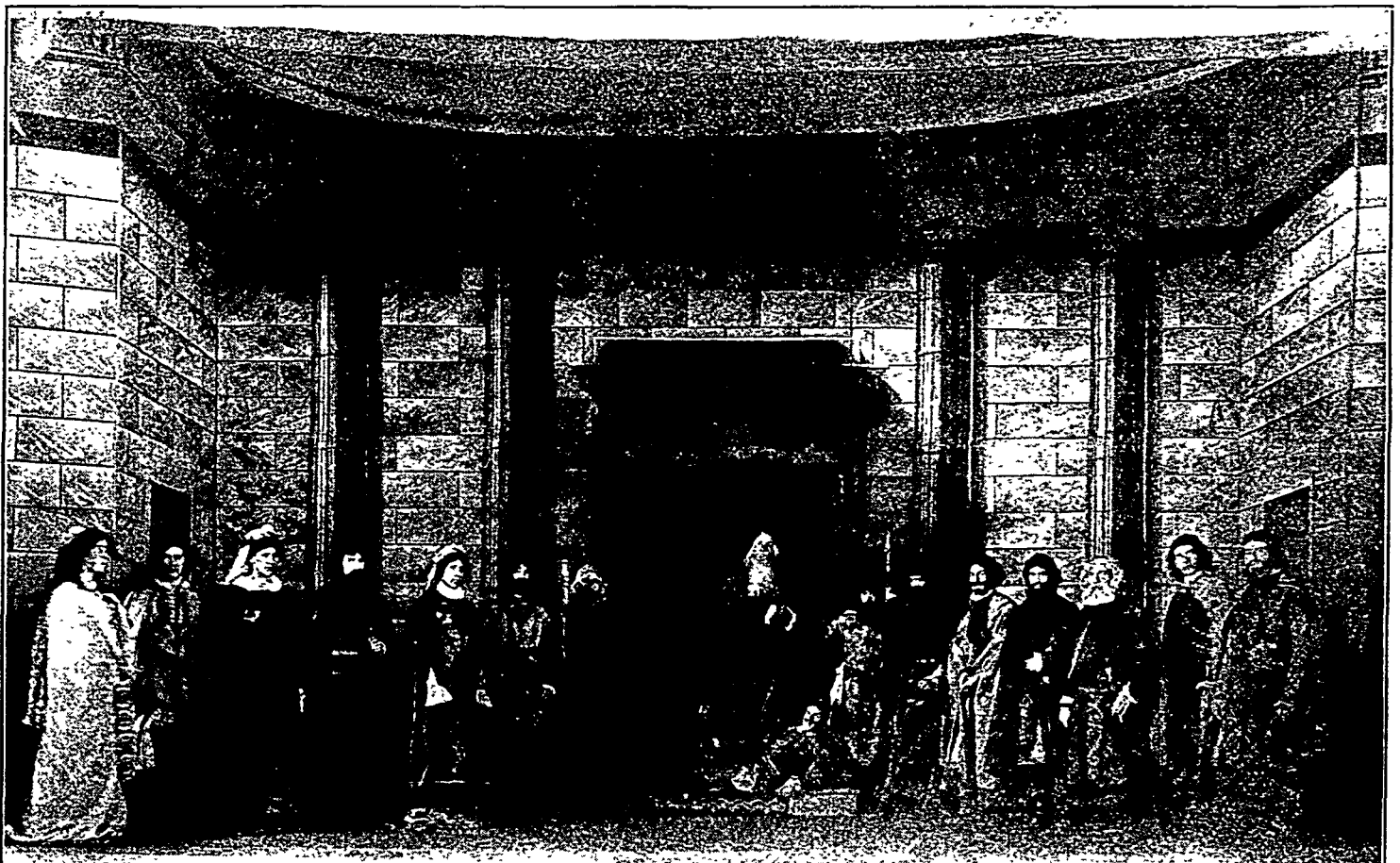
ACT I. (ENTIRE CAST).—LEAR DIVIDES HIS KINGDOM.