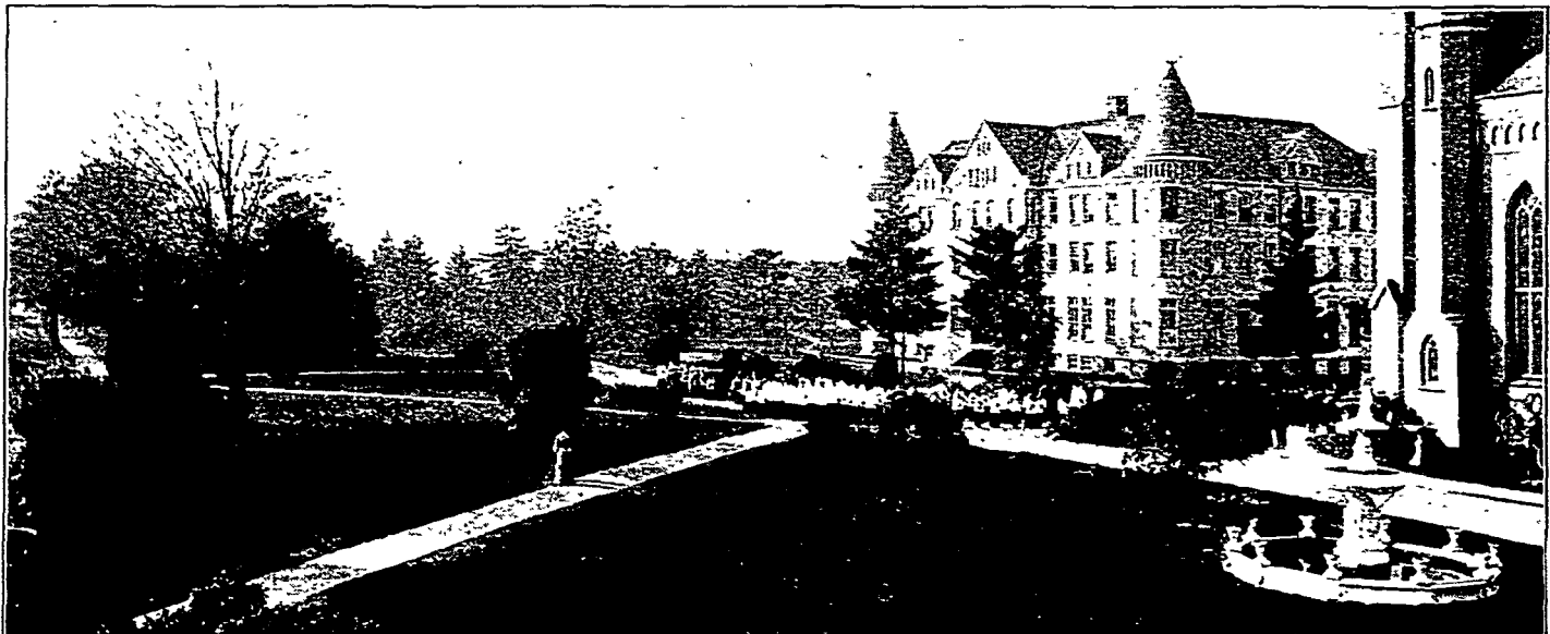
ON THE WAY TO THE PONTIFICAL MASS.

Tuesday night a formal reception was tendered the most reverend visitor in