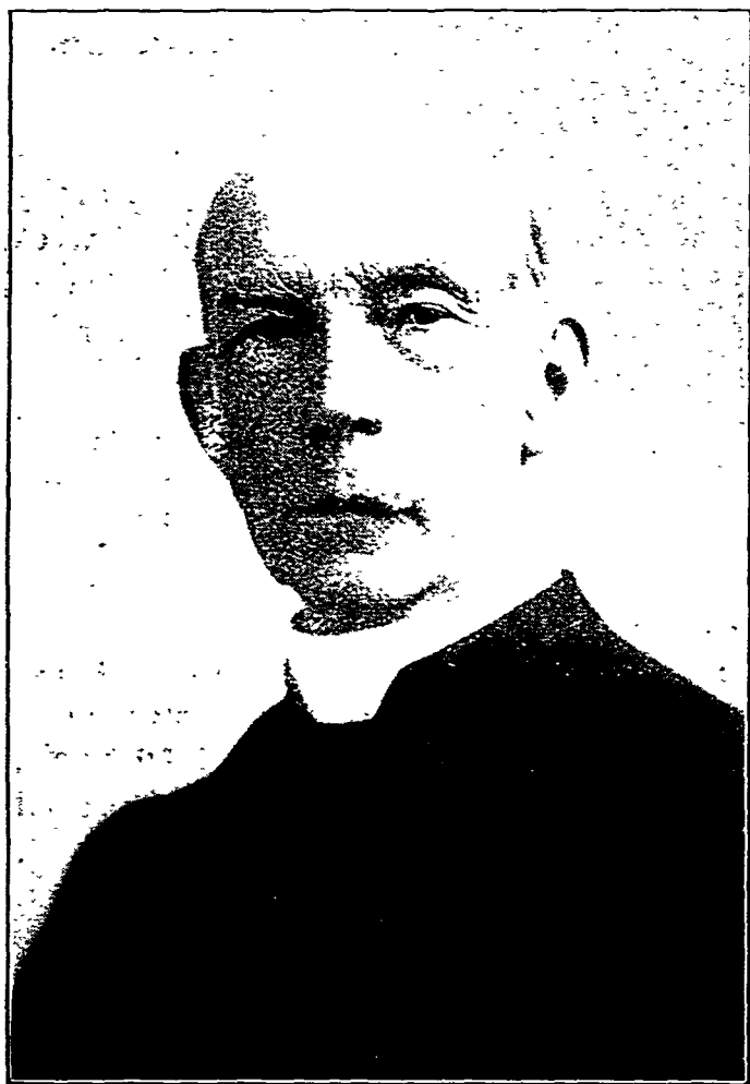
An Old Soldier's Day.