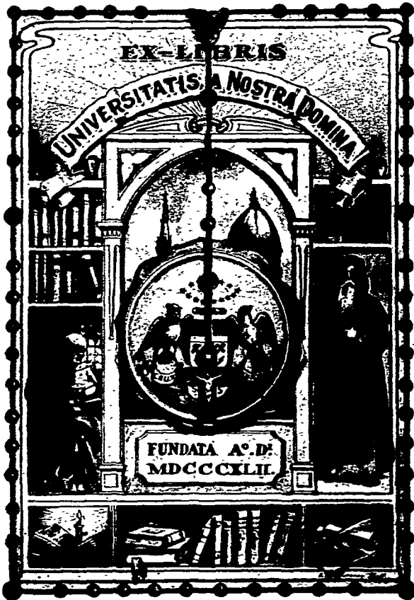
The New Book Plate.