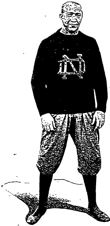
CAPT. ROCKNE All-Western End

our perfect forward passes added to terrific line-smashing trailed West Point's colors in the dust we felt sure, as we do now, that Varsity '13 has no equal in the country. Penn State was taken into camp by our men after we had covered twenty-five hundred miles the previous week. The score of 14 to 7 does not adequately tell our superiority over the Quakers, but it can be gleaned another way. Varsity hum-