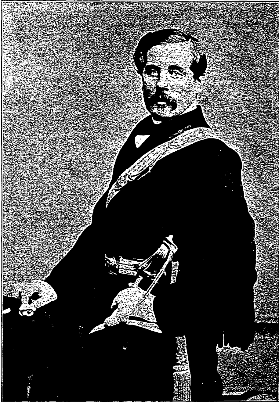
GENERAL THOMAS FRANCIS MEAGHER.

Then, my lord, I do not countenance the use of arms as immoral, nor do I conceive it to be profane to say that the King of Heaven, the Lord of Hosts, the God of Battles, bestows His benediction upon those who unsheathe the sword in the hour of a nation's peril. From that evening on which, in the valley of Bethulia, He nerved the arm of the Jewish girl to smite the drunken tyrant in his tent, down to this our day in which He blessed the insurgent