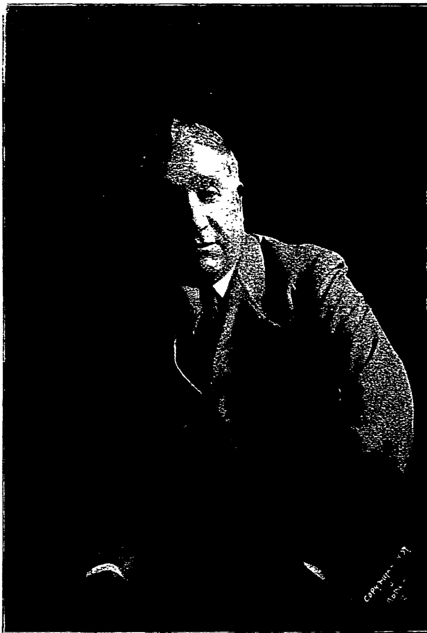
THE HON. BOURKE COCKRAN.

Yet, my friends, even when all that is said, we can not appreciate the conditions upon which this title rested unless we can bring before our minds