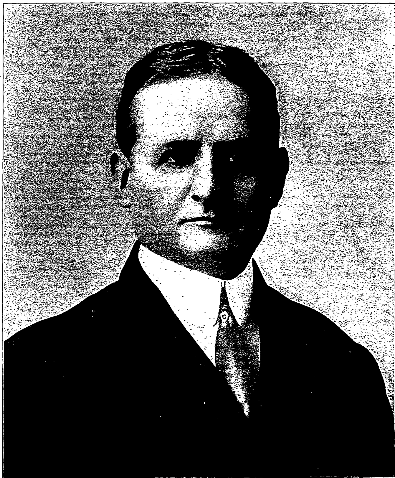
MR. JOHN F. FITZGERALD, LL. D.