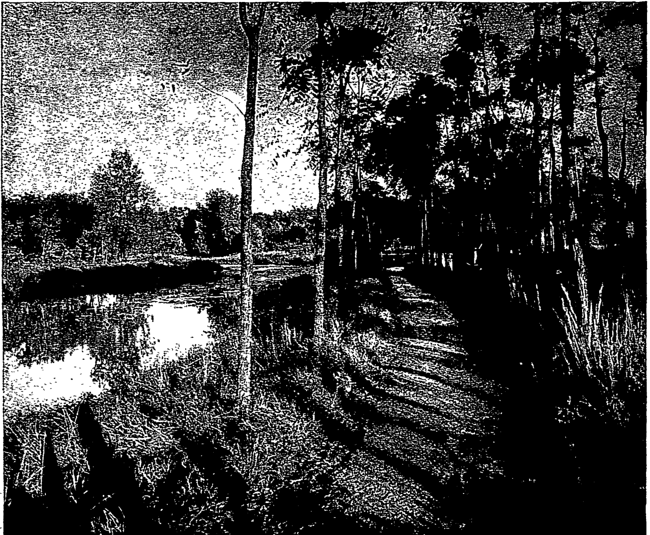
BY THE LAKE