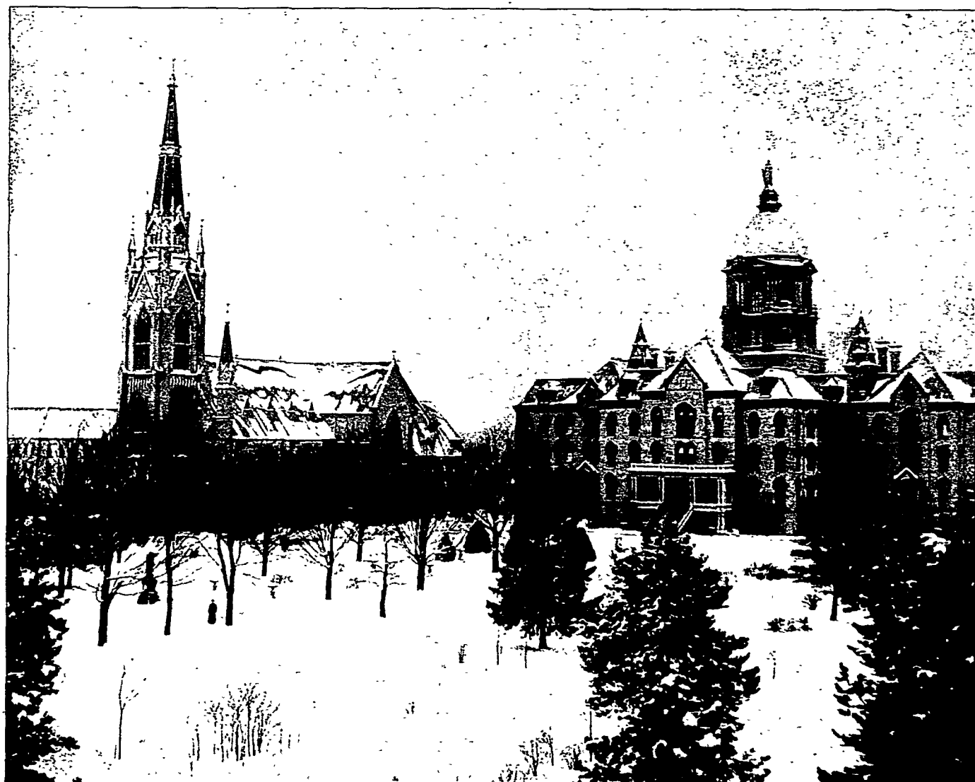
SACRED HEART CHURCH AND MAIN BUILDING

down in 1865 in order to make way for a greater structure, for the large influx of students after the Civil War made a more spacious building necessary. The third building was a hundred and sixty feet in