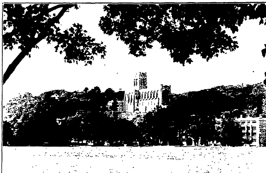
GENERAL VIEW AT WEST POINT

Showing parade ground in the foreground, Chapel in rear and up, North Barracks on right, and South Barracks in shadows at left.