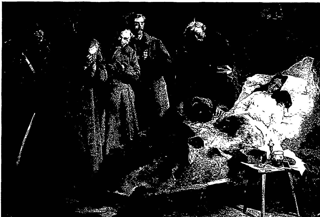
POLISH PEASANT IN EXILE—a painting in the Wightman gallery.

With the emphasis that is being placed on art today and the study of its effect on our everyday life, and with the treatment of the work of one of our own prominent painters, Emil Jacques, which appeared before in the SCHOLASTIC, it is well to call attention to a very complete and extremely interesting collection of both modern and mediaeval art that is housed here on what is generally conceived to be a most prosaic campus.