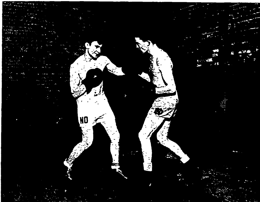
RIGHT—Hal Gooden, a junior welterweight, twice holder of light-weight title.