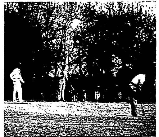
FEHLIG IN ACTION Last year's state meet.

The meet will end tomorrow afternoon. It will consist in medal play