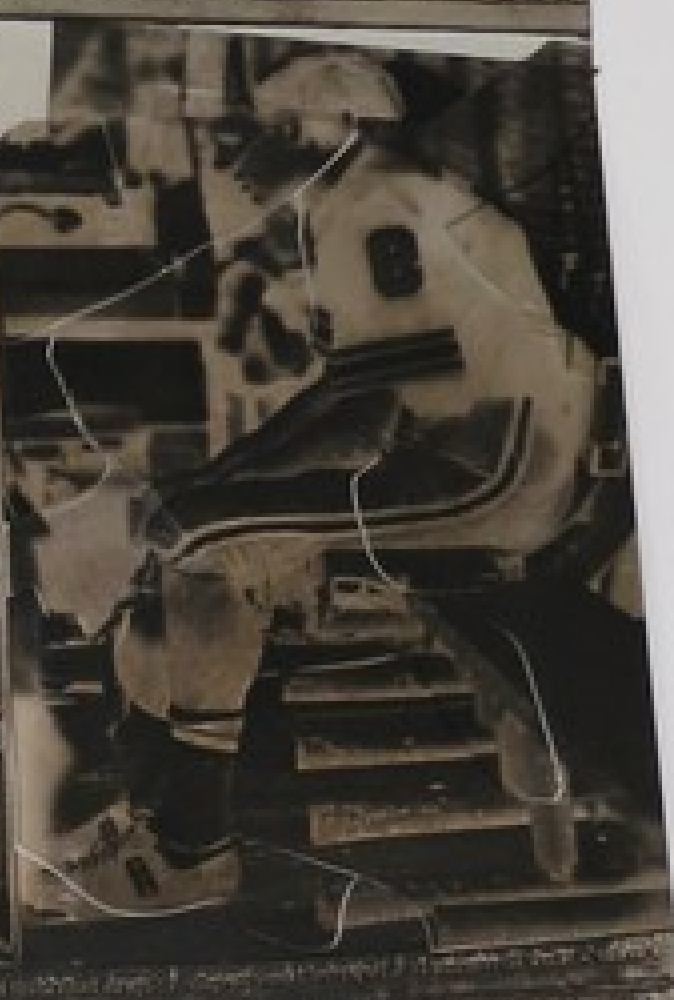
Montford's victory over Notre Dame was a significant one for the school's football team.

The game was a hard-fought battle, with Montford leading throughout most of the contest. Notre Dame's defense was stout, but Montford's offense was too strong to stop.