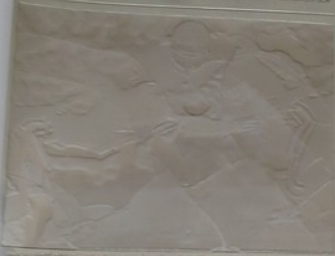
Irish players celebrate their victory over the opposition.

The Irish team's performance was exceptional, particularly in the second half where they overcame a deficit to secure a narrow victory. The players showed great resilience and teamwork throughout the match.