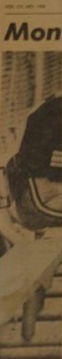
Foster's Bull Rodeo