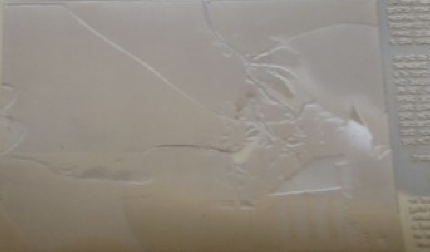
Irish players celebrate their victory over the opposition.

The match was a tactical battle, with both teams displaying high levels of skill and strategy. The Irish coach's substitutions in the second half were well-timed and effective.