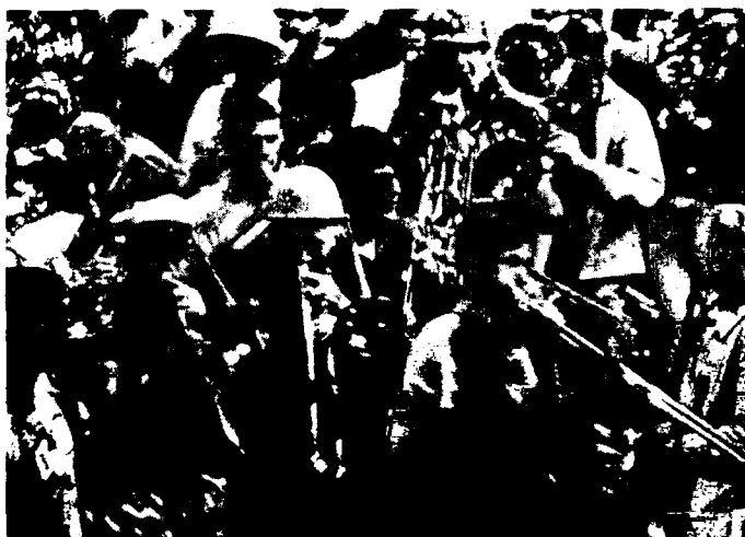
AN IRISH CROWD WHOOPS IT UP.

Orenthal (wouldn't you call yourself O.J. too?) comes here as the nation's leading rusher, with over 600 yards gained against Washington State, Texas,