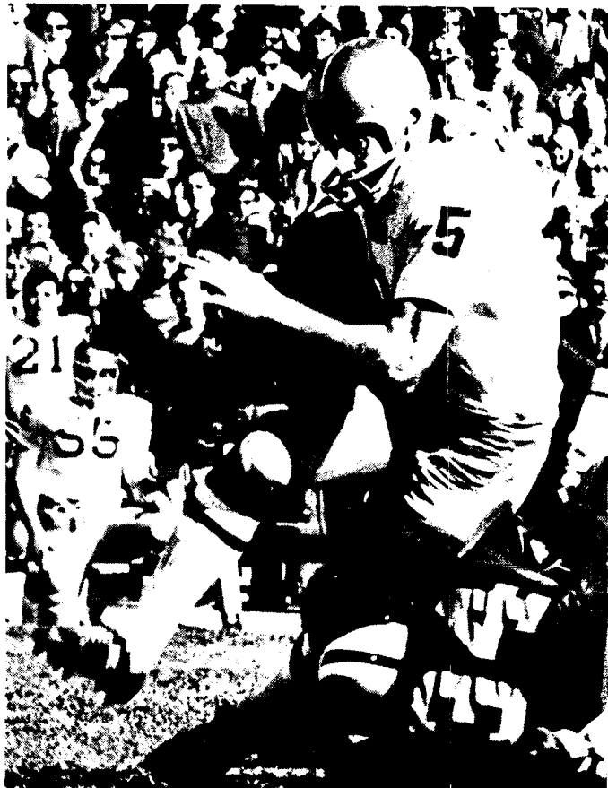
. . . an increase in weight from 187 to 213 pounds improved his running