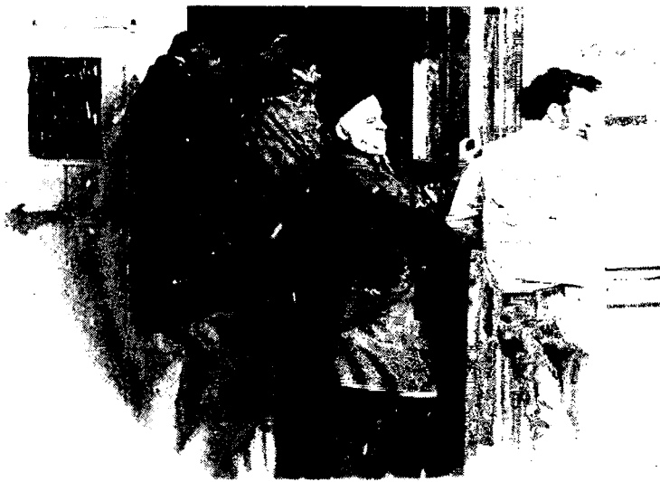
Mace at Notre Dame.