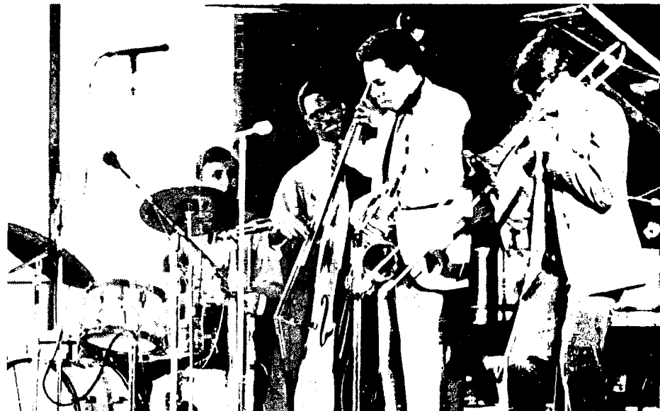
Collegiate Jazz Festival swings into final competition today with top bands and combo's from across the country performing over in Stephan Center. Prizes will be awarded this evening.