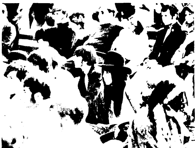
The first annual Potawatomi Park love-in was celebrated yesterday. Flower children, high school students and 20 loving cops joined in the festivities.

Each candidate for hall president and the Student Assembly must take part in an Open Forum scheduled for May 5 in the hall from which they hope to be elected. Students will vote after the forum in the halls in which they plan to live next year.