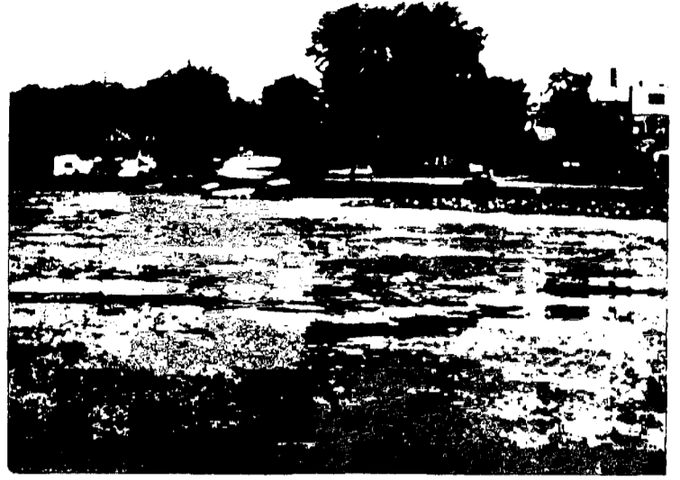
Stone Lake in Cassopolis, Michigan is one example of the growing pollution