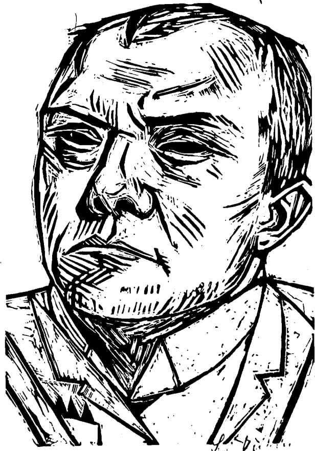
The Notre Dame Art Gallery is currently featuring a showing of 116 paintings of the German expressionists of the early 20th century.