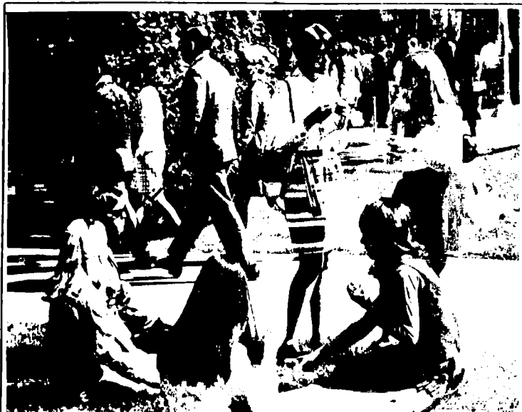
Cheer up! Spring is only a few months away... so football season can't be far behind. But as for today, expect partly cloudy and continued rather cold weather. Tuesday night and Wednesday, cloudy with chance of snow and little change in temperatures. Tuesday highs 20-25 north, and 25-30 south.