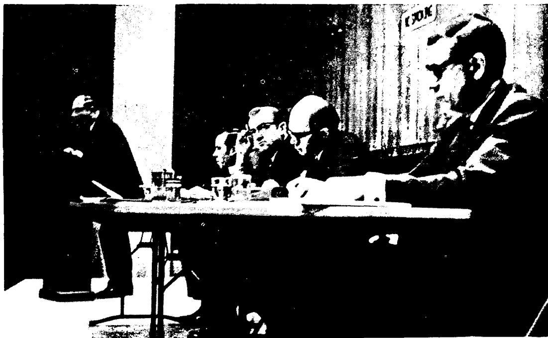
Members of a panel discussion at the Pollution Conference talked yesterday in the Library Auditorium.