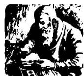
Craftsmen in Optics®

He added that the first objective would be "to restore essential mail services," such as movement of welfare and social security checks, but estimated it would take "several days before meaningful services are restored" in New York.