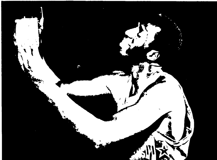
Meadowlark Lemon of the Globetrotters smiles for the camera.

A crowd of 75,000, a world's record for a single game, watched them perform in Berlin's Olympic Stadium in 1951. Their largest U.S. turnout was 36,256, at the Los Angeles Coliseum on April 8, 1953.