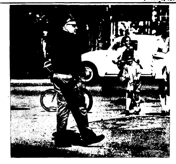
Marchers view of South Bend

When questioned about the reaction Notre Dame students can have to the war, McCarthy said, "It is very possible for us to set up at Notre Dame a sanctuary where we can stand together and co-operate together." Such a sanctuary would provide students with a unified effort to resist induction into the armed services, McCarthy