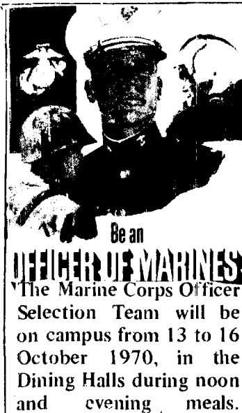
The Marine Corps Officer Selection Team will be on campus from 13 to 16 October 1970, in the Dining Halls during noon and evening meals.