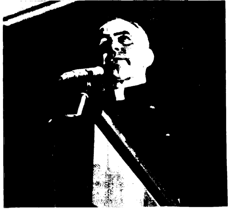
Rev. Theodore Hesburgh