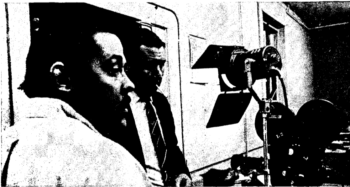
NBC crewmen set up a film clip in the "Observer" office

This segment of First Tuesday will probably be 20-25 minutes in length and will be aired at 9:00 PM on WNDU Channel 16.