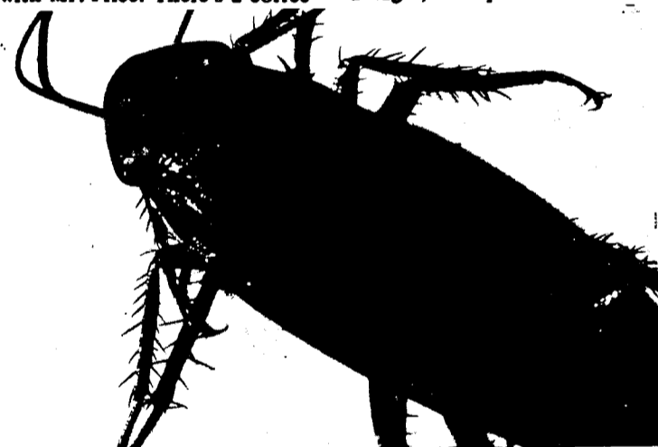
A St. Ed's bug

Tickets On Sale—A.C.C. & Student Union Ticket Office