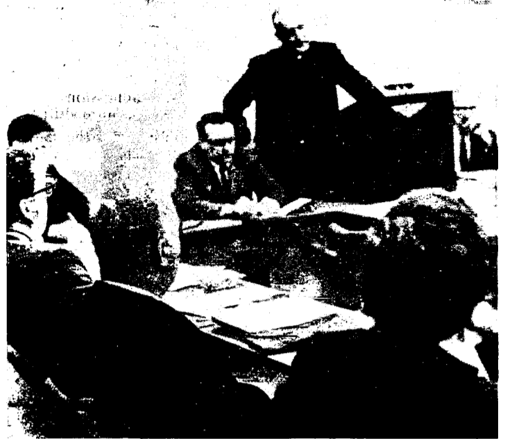
The scene at last night's faculty Senate meeting.