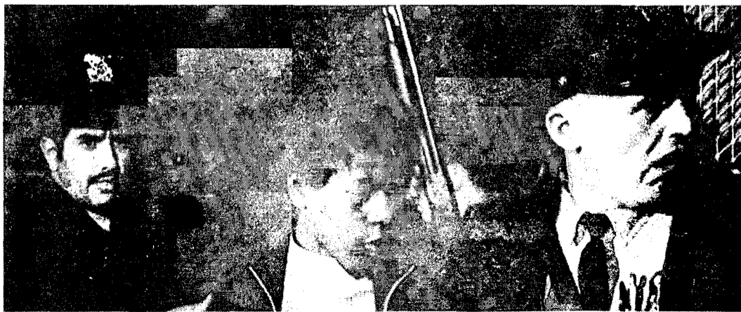
Detroit police lead a Black Panther party member to a waiting police van late Saturday after Black Panther party members barricaded an inner city house near where one policeman was shot and killed and a second wounded.

Police Commissioner John Nichols then delivered an ultimatum to the remaining three occupants before directing police to fire tear gas into the house "because the situation in the peripheral areas was becoming tense."