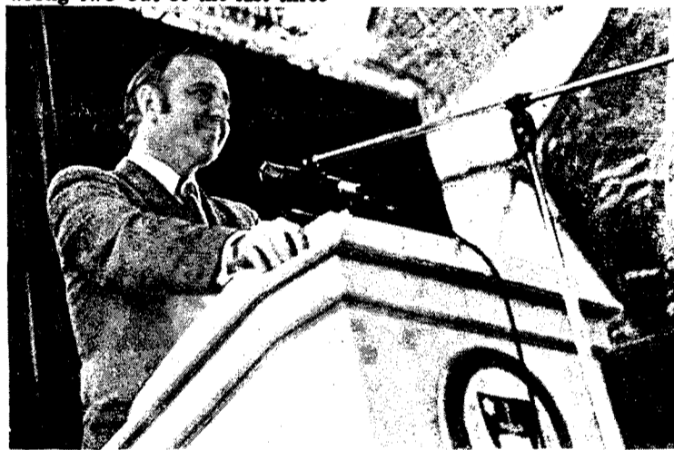
Senator Charles Goodell speaking at Notre Dame last year.