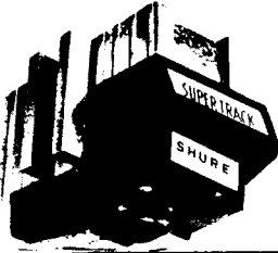
V-15 SHURE Type II (Improved) $67.50 Phono Cartridge

True high fidelity sound re-creation begins at the source of sound. Just as a camera is no better than its lens, a phonograph system is no better than its cartridge. This breathtakingly precise miniaturized electric generator (that's what it really is) must carry the full burden of translating the stereo record groove into usable electrical impulses — and should do this without adding or subtracting from what is on the recording. Knowing this, Shure quality standards are rigidly maintained at the highest levels.