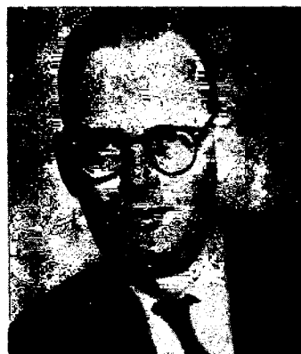
Arthur C. Clarke