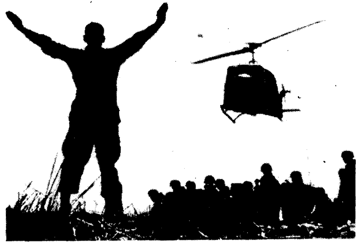
KHE SANH, S. Vietnam: Ground controllers directs a Huey helicopter to a landing zone while South Vietnamese troops wait to board it for a combat assault into Laos Wednesday. South Vietnamese officials said Thursday that their forces in Laos have reached Tchepone, the major center for stockpiling of Communist arms and supplies on the Ho Chi Minh complex.

Four Americans were reported killed and seven wounded Thursday when Communist gunners shot down two U.S. helicopters near "the rockpile," east of Khe Sanh, base of operations for the 20,000 South Vietnamese and 9,000 Americans in the drive.