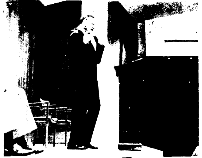
Congressman Henry Reuss