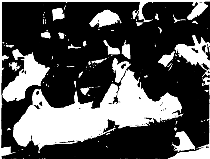
The Hall Presidents' Council