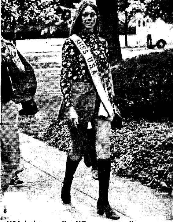
Miss USA looks over the ND campus as the campus does likewise.