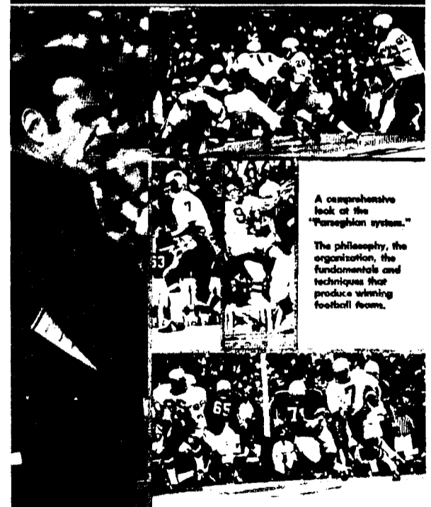
A comprehensive look at the "Parseghian system." The philosophy, the organization, the fundamentals and techniques that produce winning football teams.