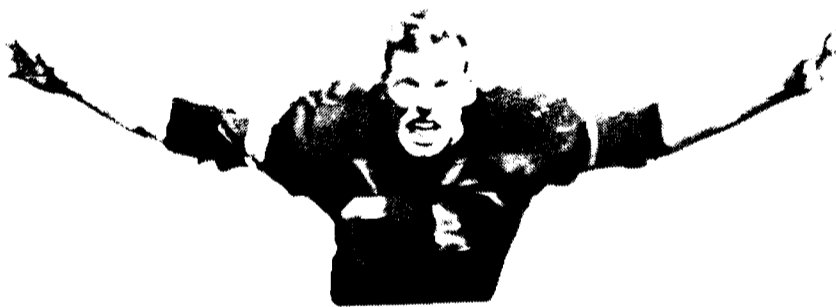
six cents to clear him

6. You have been wondering about shirts. Our suggestion is two polo shirts a week. For those of you who who are