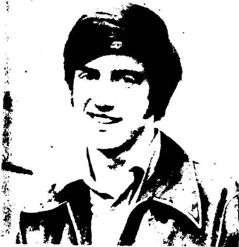
Motto: no confrontation with Trustees decision.