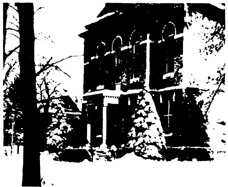
LaFortune: due for renovations.

"If this continues," he said, "the place may cease to be a student's center." Currently, seven organizations are seated in LaFortune.