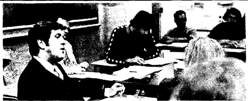
The SLC once more discussed the University sexuality code at yesterdays meeting.