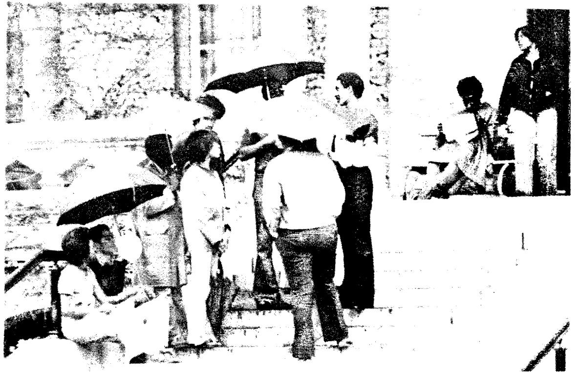
Concerned black students protested racial discrimination yesterday on the steps of the Administration Building.

A Postal Service source said, "If everything goes right, we could have it - the delivery - cut back in effect by the end of the year."