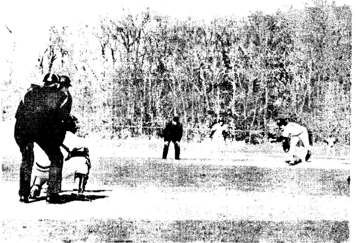
Consistency on the mound was a major factor in Notre Dame's six-game winning skein.