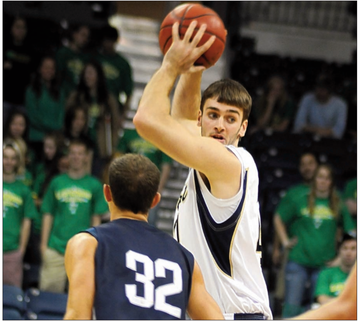
VANESSA GEMPIS/The Observer