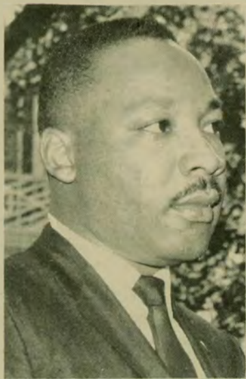
Rev. Martin Luther King

"And now he is dead, cut down in mid-stride along the road. There is no answer, outside the inscrutable Providence of God, to the question on