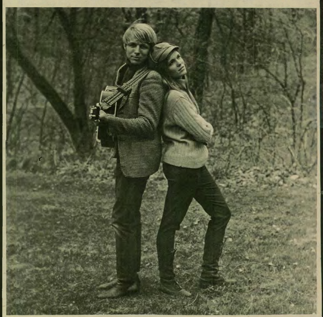
SHOWS AT 9:00 AND 11:30