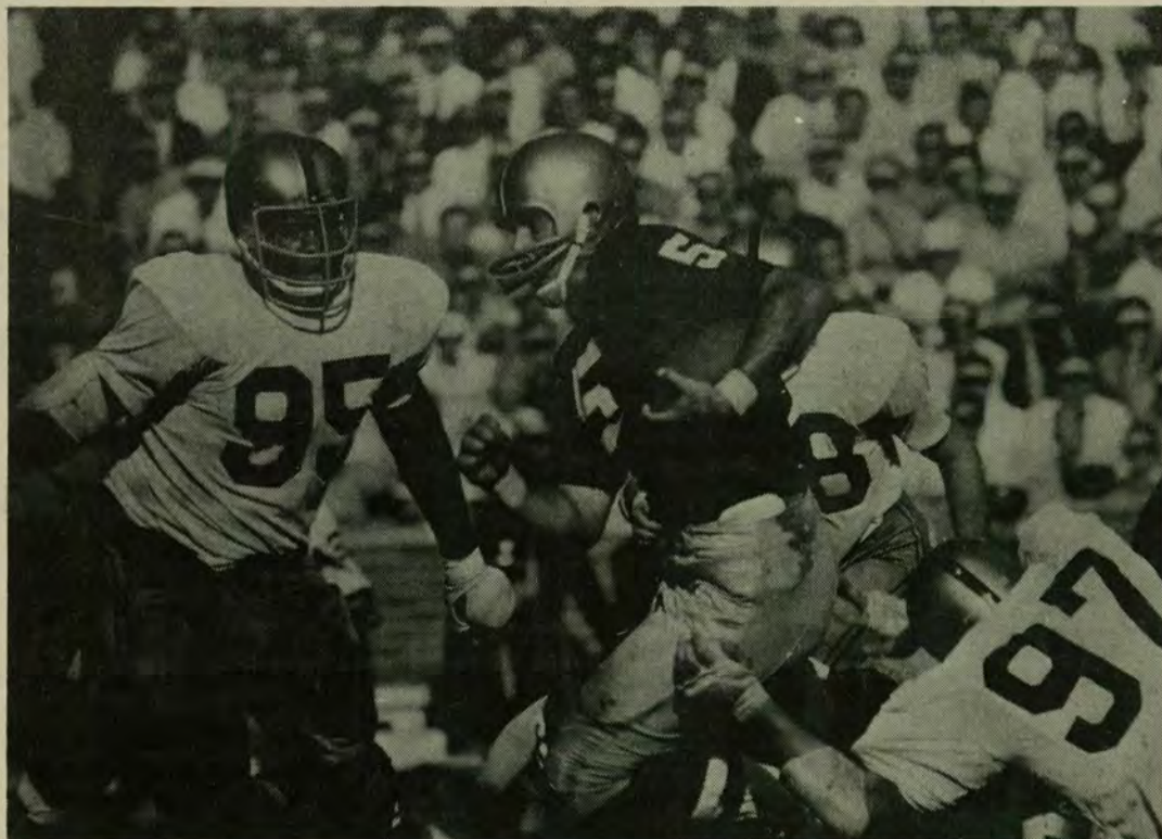
But then Hanratty's protection broke down and Purdue took control as....