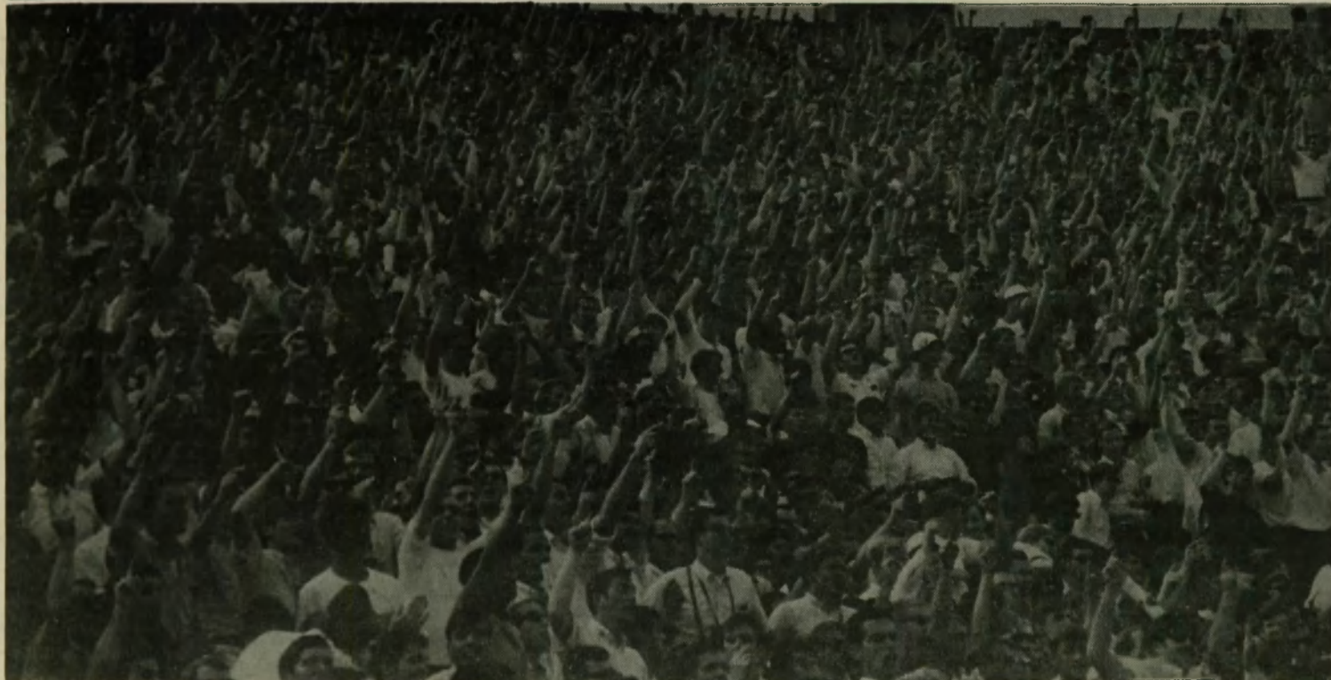
When the day began, we were No. 1. We took a 7-3 lead in the first 20 minutes as....