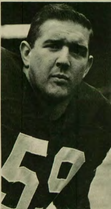
Ex-Irish Pro: No. 10