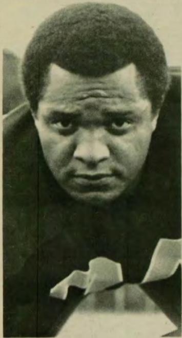
Ex-Irish Pro: No. 9

WEST — Colorado 5 over Oklahoma State, Oregon 7 over Washington State and Oregon State 17 over UCLA.