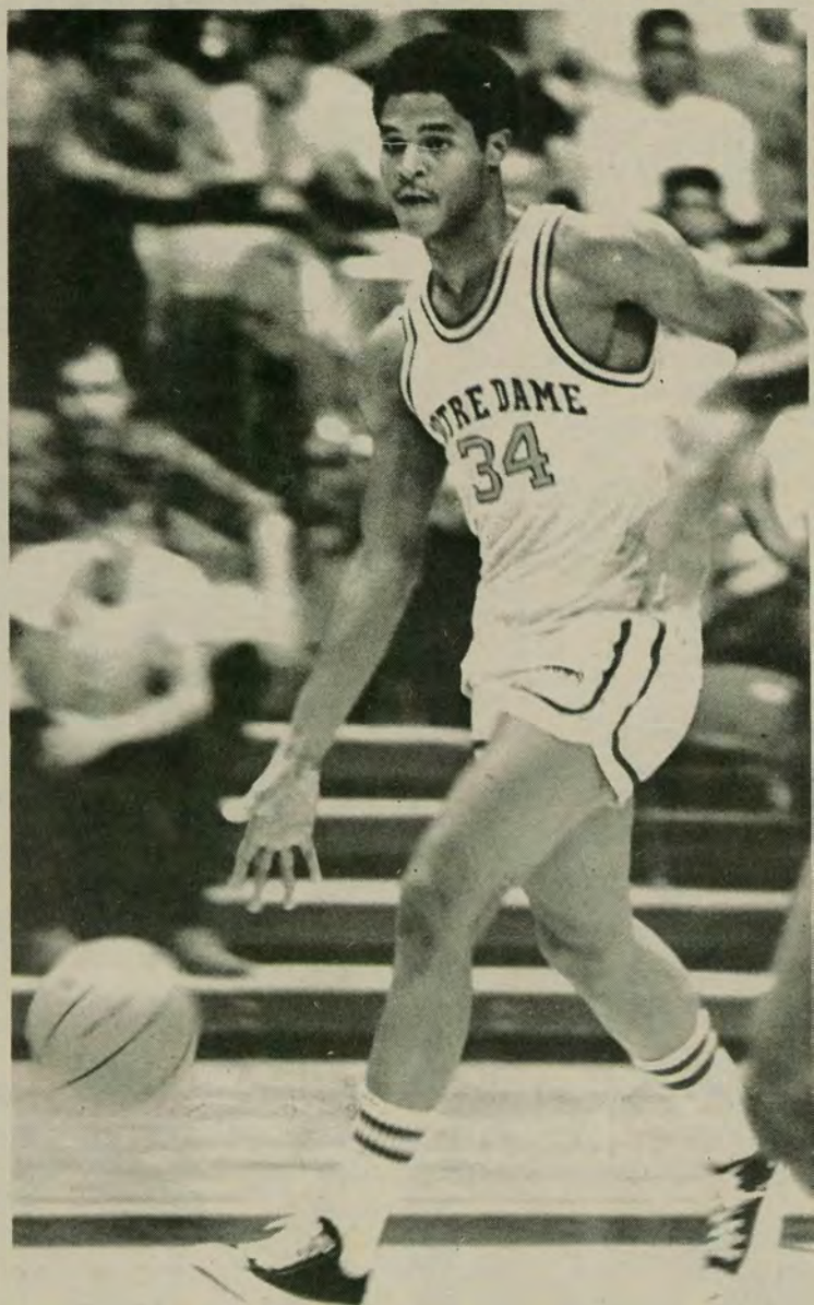
Top scorer for the Irish was Austin Carr with 20 points.