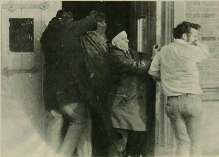
Mace at Notre Dame.