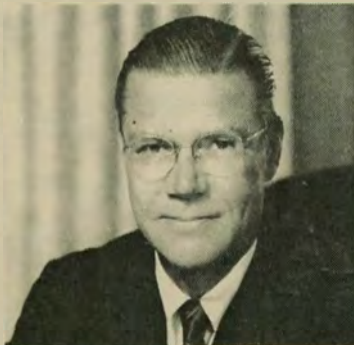
Robert Strange McNamara

The dedication events will start with a 10 a.m. Mass in Sacred Heart Church celebrated by Notre Dame's president, the Rev. Theodore M. Hesburgh,