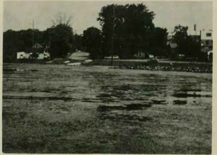
Stone Lake in Cassopolis, Michigan is one example of the growing pollution