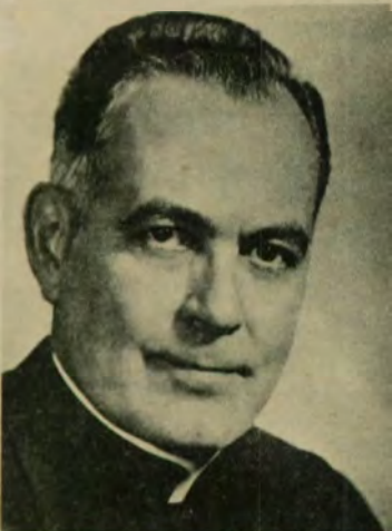
Rev. Theodore M. Hesburgh

Twenty-one of the elective hours will consist of approved upper level courses in American literature, history and government, 9 of which must be in one field and 6 in the remaining two. The 3 other elective hours may come from among upper level courses in philosophy, sociology, economics or art.