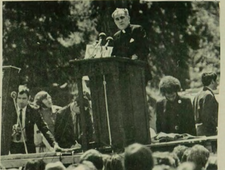
Fr. Theodore Hesburgh, C.S.C., delivers his statement on Cambodia.

Regarding a potential class boycott Father Hesburgh appeared against the idea. He accentuated the importance of education and the need for leadership saying, "We are living in an age of midgets. I want you to prepare to be giants."