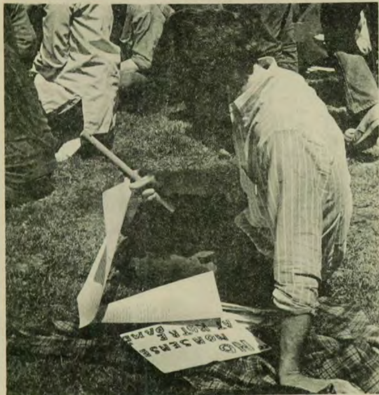
The scene at yesterday's strike activities.