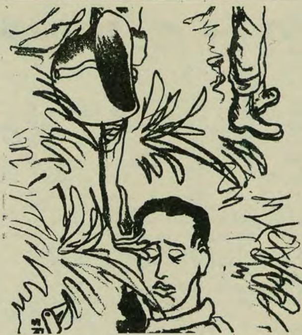
"Everything I stand for is what these kids want." — Richard M. Nixon

The opinions in the editorials, news analysis, and columns of The Observer are solely those of the authors and editors of The Observer and do not necessarily reflect the views of St. Mary's College, the University of Notre Dame, their administrations, faculty, or student bodies.