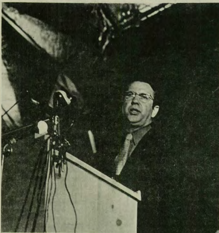
U.S. Senator Vance Hartke of Indiana urged students in a speech last night in Stepan Center to "channel their political energies into supporting Congressional peace candidates."