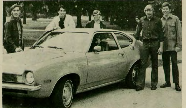
The "Pinto" with the Four Horsemen plus two.

Success of the project depends on strong student cooperation.