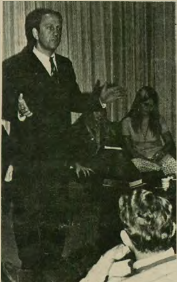
Congressman John Brademas

He claimed that defense spending, "one of several critical national priorities," must be re-ordered. He is basing his campaign for a seventh term as In-