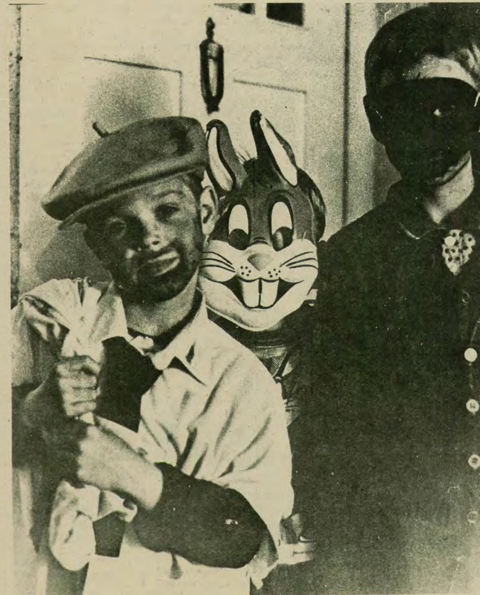
Ah, to be 10 years old again. To believe in ghosts again. Ah, the bliss of ignorance.

For the deep underlying existential message, put this cryptogram to the mirror.