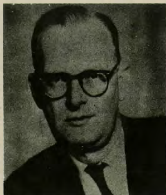
Arthur C. Clarke