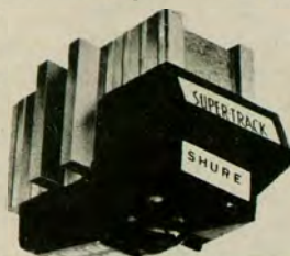
V-15 SHURE Type II (Improved) $67.50 Phono Cartridge

True high fidelity sound re-creation begins at the source of sound . Just as a camera is no better than its lens, a phonograph system is no better than its cartridge. This breathtakingly precise miniaturized electric generator (that's what it really is) must carry the full burden of translating the stereo record groove into usable electrical impulses — and should do this without adding or subtracting from what is on the recording. Knowing this, Shure quality standards are rigidly maintained at the highest levels.