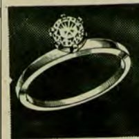
6 PRONG DIA- MOND SET..... $495