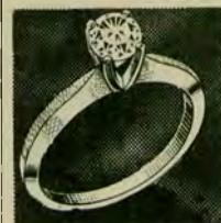
DIAMOND SOLITAIRE..... $85

AT FOX'S YOU GET A BIGGER, BETTER QUALITY DIAMOND FOR LESS MONEY!