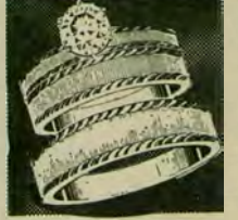
DIAMOND 3-SOME..... $150