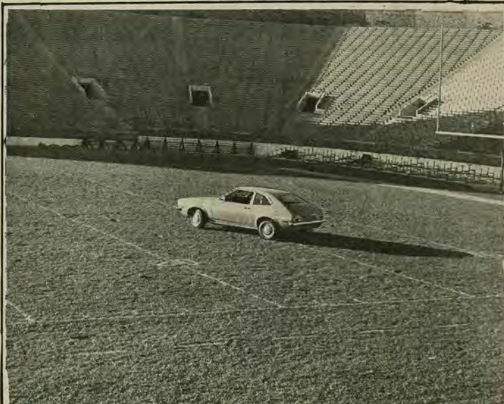
FORD'S NEW PINTO THE LITTLE CAR THAT CASTS THE BIG SHADOW

Ford's Pinto is priced and sized like the little imports, but has more room inside. Now you can have your economy and enjoy it, too.