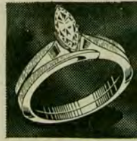
MARQUISE CUT $395 DIAMOND.....